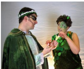
Oberon & Puck cause mischief.

Book now to avoid disappointment! For more information on the play and to see more photos check out the Khandallah Arts Theatre Facebook page or the KAT website.