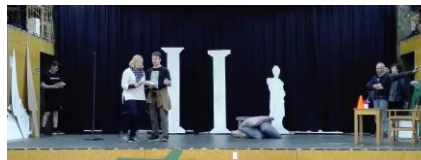
The cast rehearse.